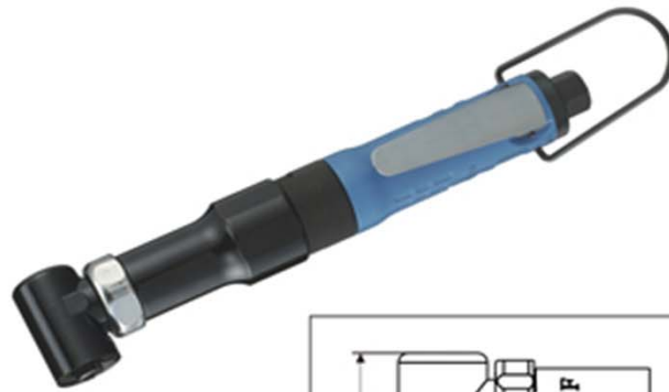
OP-304L90 F Rear exhaust 後排氣